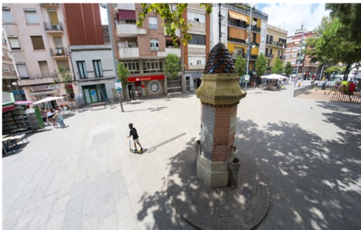
Plaça Espanyola, in the heart of Hospitalet, is constantly busy and intensely used by different collectives and groups with highly diverse purposes. For this reason, this square is witness to a buzzing community life as well as to the conflict that might naturally derive from it.

be presented yet, will share how they reached out the different stakeholders in the design of the plan and the coordination model adopted. The group will be accompanied along the short train trip to Hospitalet City Hall.